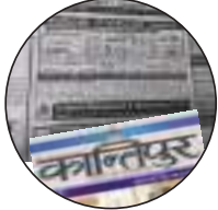
Advertising in Daily Newspaper