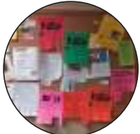
Office Notice Board