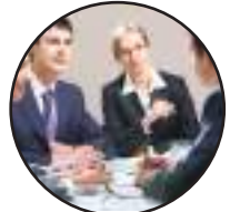
Taking Interview By Employer