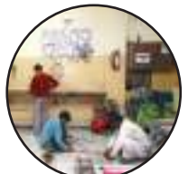
Trade Test for Selected Candidates