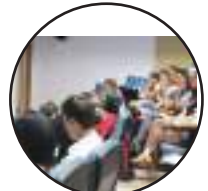
Taking Orientation Class