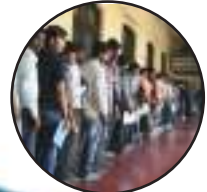
Going to Interview